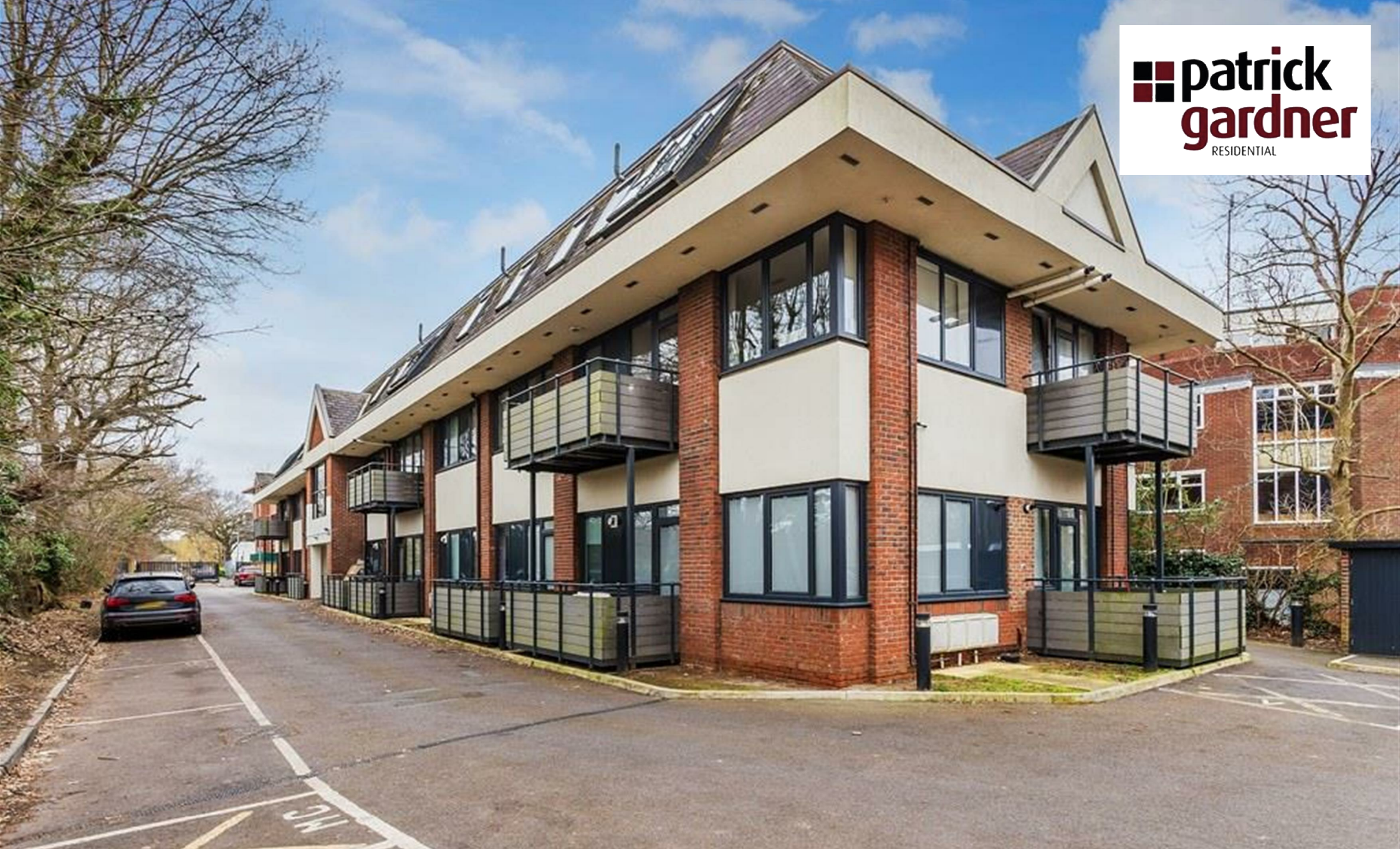
Flat 14, Prime House Challenge Court, Leatherhead, KT22 7DE